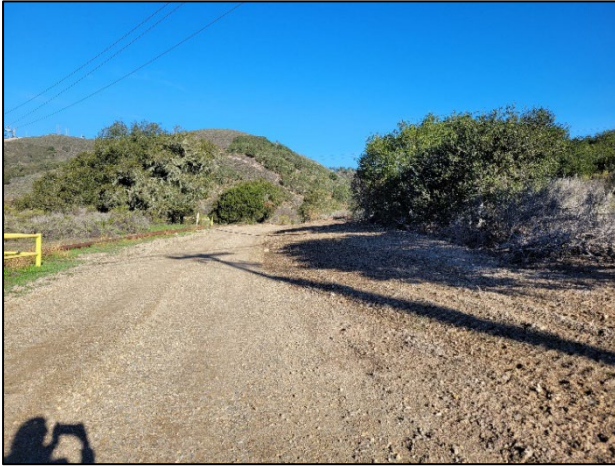
Photograph 5. View north from the eastern end of the existing access road, showing coast live oaks on edge of road. No trimming is anticipated for these trees.