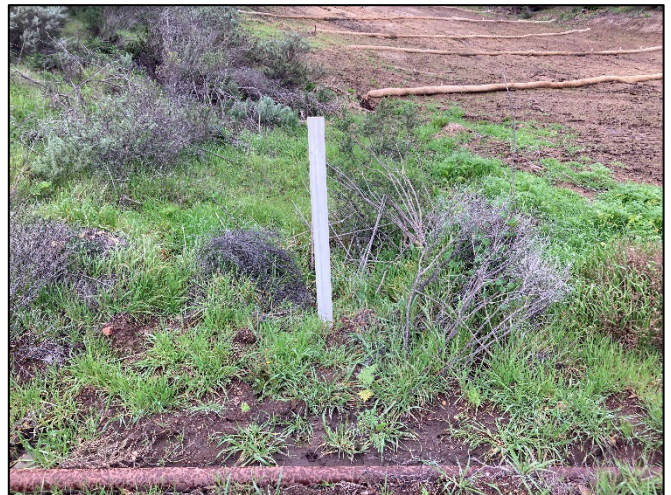
Photograph 16. View of pole location 2 (white stake) at the edge of California sagebrush scrub.