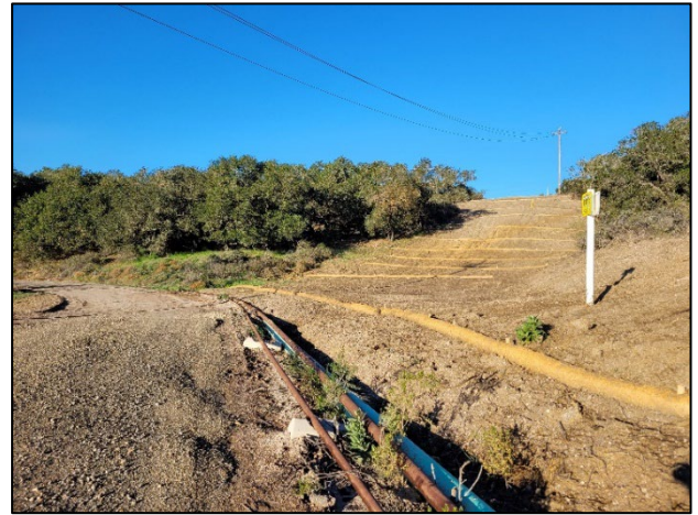
Photograph 10. View of existing barren area associated with powerline corridor, located west of Pad Purisima 33.