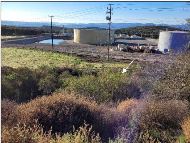
Photograph 3. View of ruderal (foreground) at edge of production pad, with a thin band of coastal scrub that includes scattered blue elderberry ( Sambucus nigra , white arrow), with annual grassland and the Lompoc Oil and Gas Plant in the background.