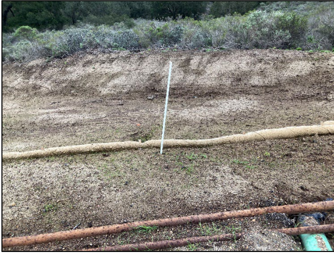
Photograph 13. View of pole location 3 (white stake), within an area that was previously cleared by Southern California Gas and is considered bare ground.