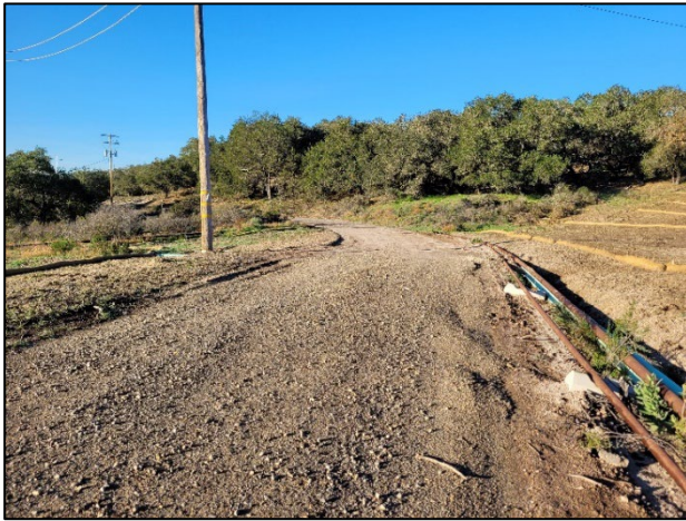
Photograph 9. View west along the western access road from the edge of Pad Purisima 33.