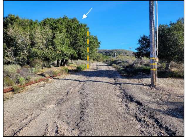
Photograph 14. View north along western access road from the existing gate at the end of the road, showing Quag-41 (white arrow). Quag-42 and Quag-43 are smaller and located to the left of Quag-41, growing close together and set further back from the road.