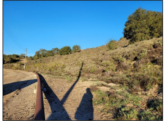
Photograph 2. View of the northern boundary of Pad Purisima 33, facing northwest, showing the existing pipelines at the edge of the production pad, with California sagebrush scrub and scattered coast live oaks ( Quercus agrifolia ).