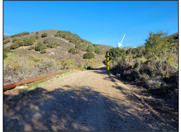
Photograph 6. View north along the eastern access road, with coastal scrub habitats along road edge. Quag-44 is shown with a white arrow, and the potential extent of trimming is delineated.