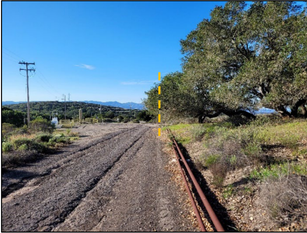
Photograph 13. View south along western access road, showing Quag-40 (white arrow), with potential trimming lines.