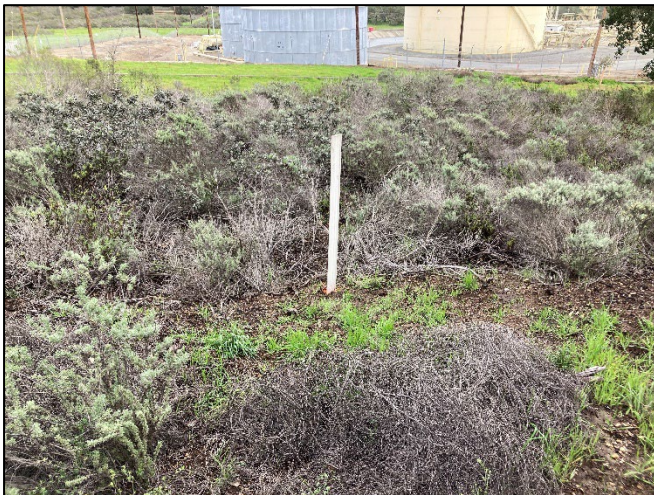
Photograph 15. View of pole location 1 (white stake), within California sagebrush scrub.