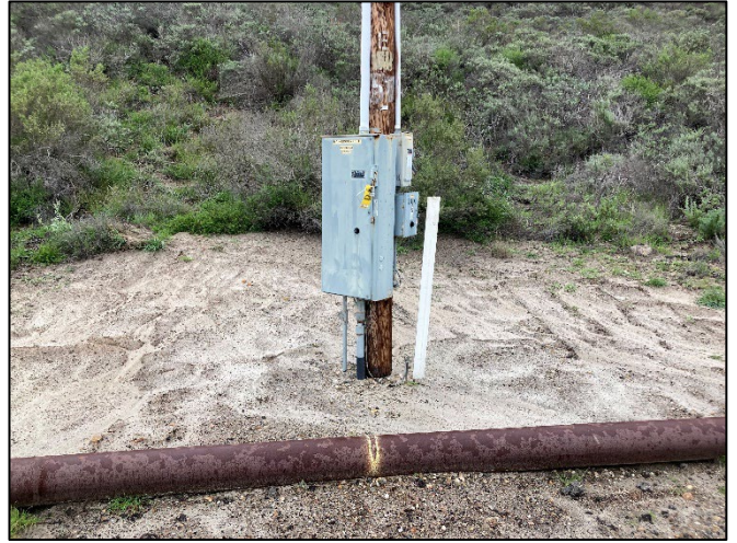
Photograph 14. View of pole location 3 (white stake), adjacent to an existing pole and within the bare ground and ruderal footprint of the existing pole.