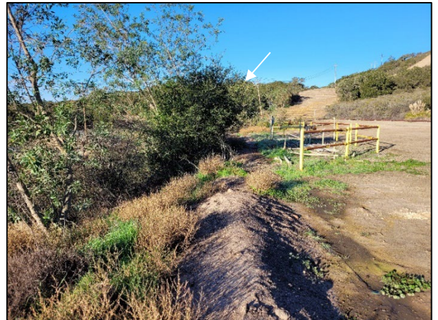
Photograph 4. View of the southern boundary of Pad Purisima 33. Quag-31 is shown with a white arrow; this tree occurs at the edge of the pad but is protected by existing infrastructure and would not be impacted by the proposed Project.