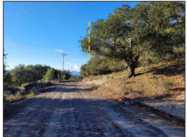
Photograph 12. View of Quag-38 along western access road, with potential trimming highlighted with a dashed orange line. Trimming will be minimized and will not extend passed the edge of the existing road. Quag-39 is indicated by the white arrow.