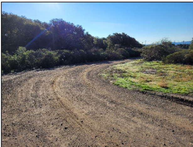
Photograph 7. View southeast along the eastern access road from the sharp bend in the road.