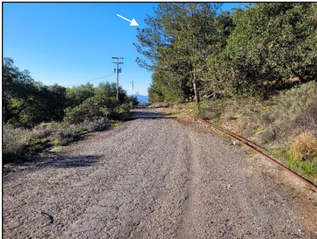
Photograph 11. View along western access road. Bishop pine indicated with a white arrow.