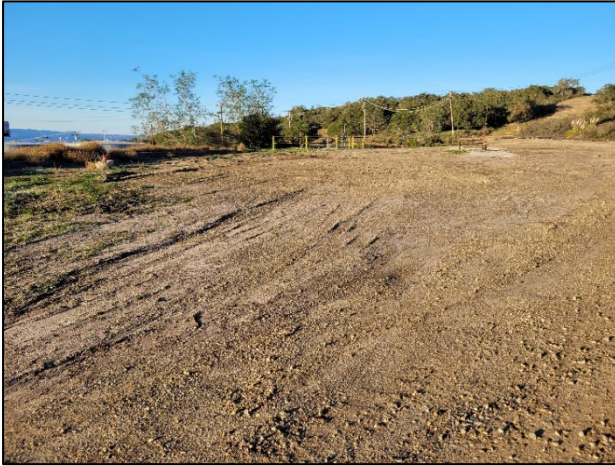
Photograph 1. View of Pad Purisima 33, facing west from the east access road to the production pad.