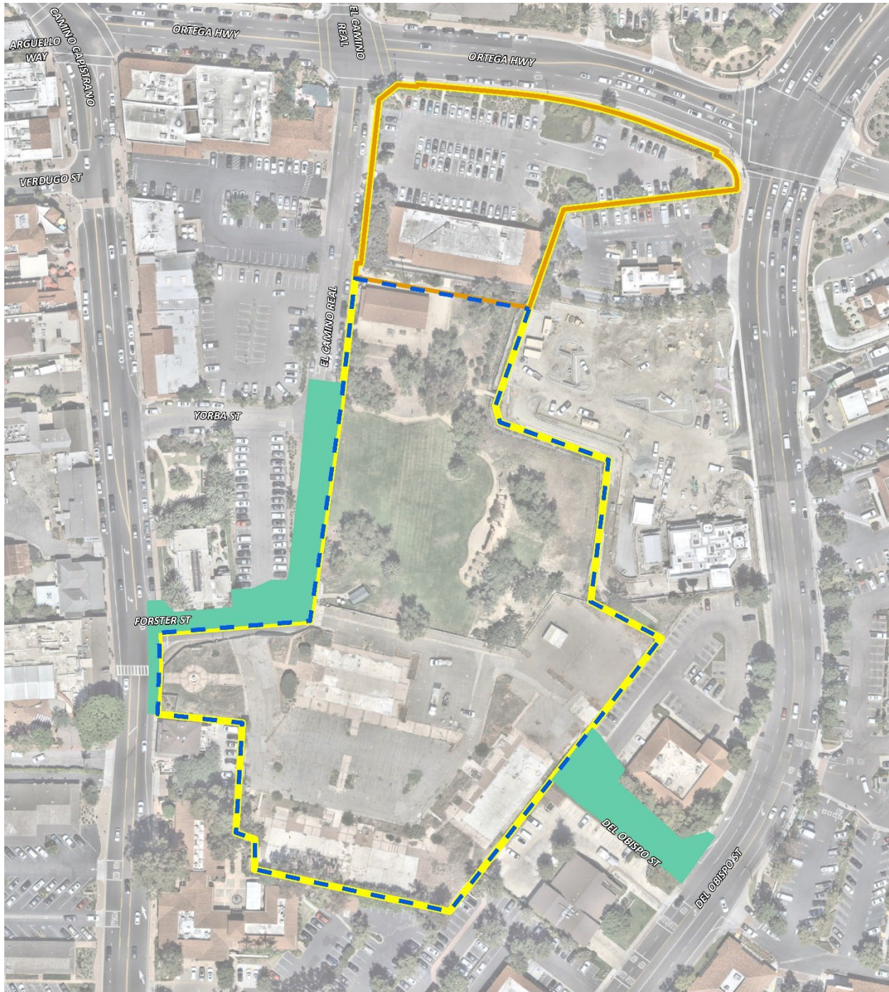
EXHIBIT 1-A: LOCATION MAP