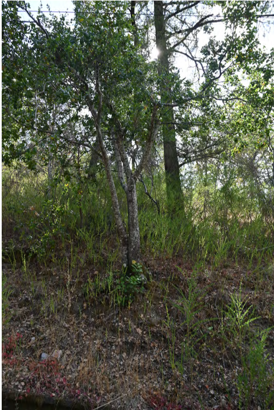
Tree #2, a coast live oak located in future road turnout. Located below electrical distribution lines and subject to clearance pruning.