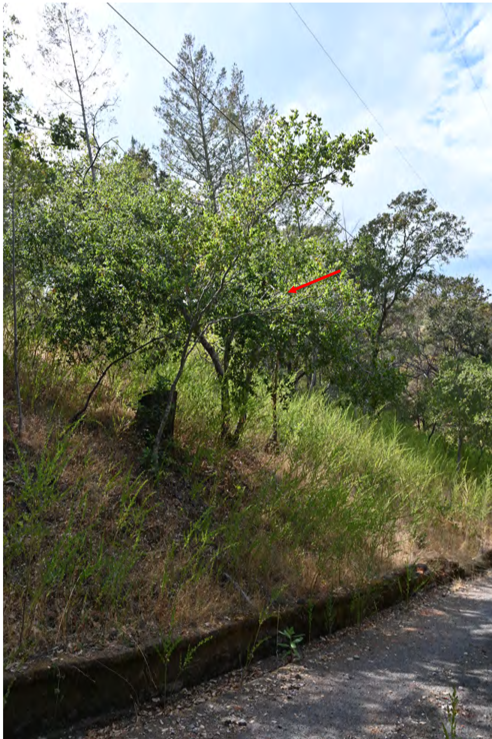
Tree #1, a coast live oak located in future road turnout. Located below electrical distribution lines and subject to clearance pruning.