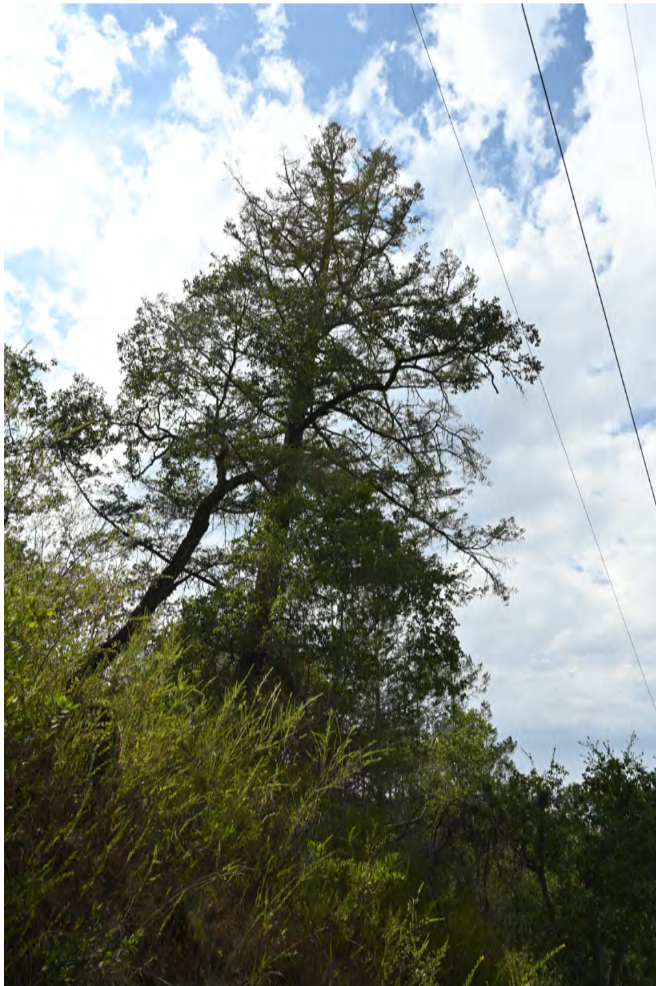
Tree #3, a Douglas fir, is in decline from boring insect attack. The tree is likely located in grading limits for road turnout.