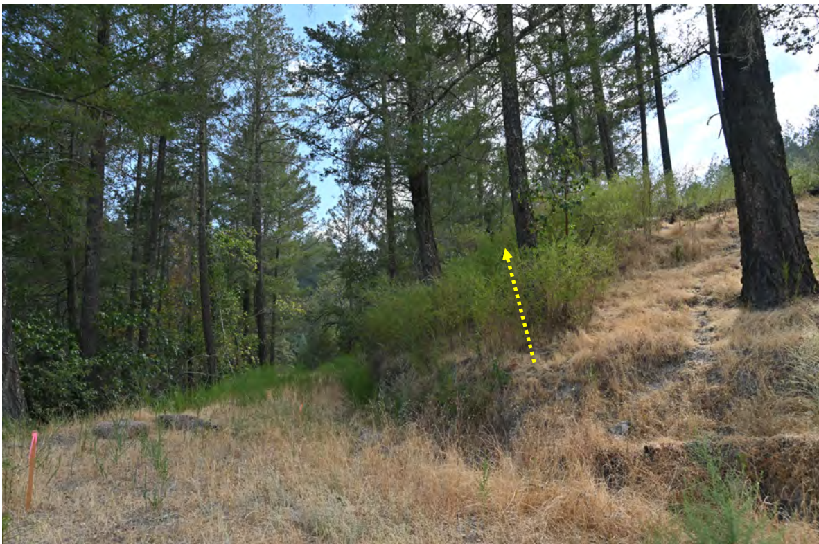
View to the south with the arrow indicating approximate roadway grading limits extending upslope and impacting 16 trees (3 oaks and 13 Douglas fir). (GPS waypoint 002.)