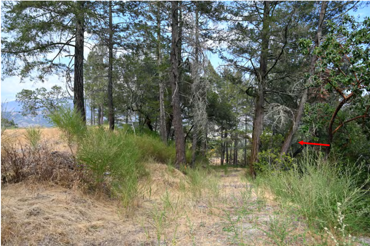
The south end of the roadway grading limits the area with trees #14 through #19. Trees #18 and #19 are on the left (arrow). Significant areas of the invasive French broom are present.