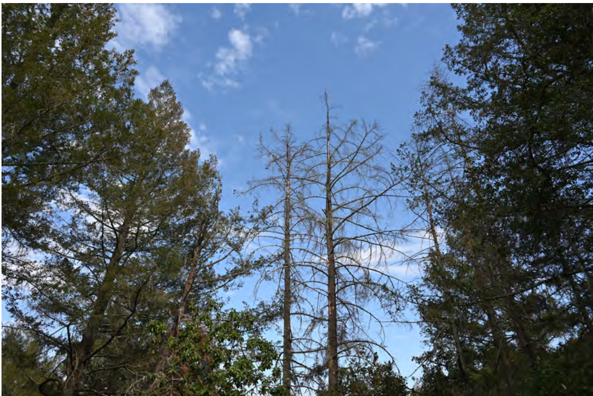
Numerous Douglas firs are either dead or in decline in this area from the FFB.