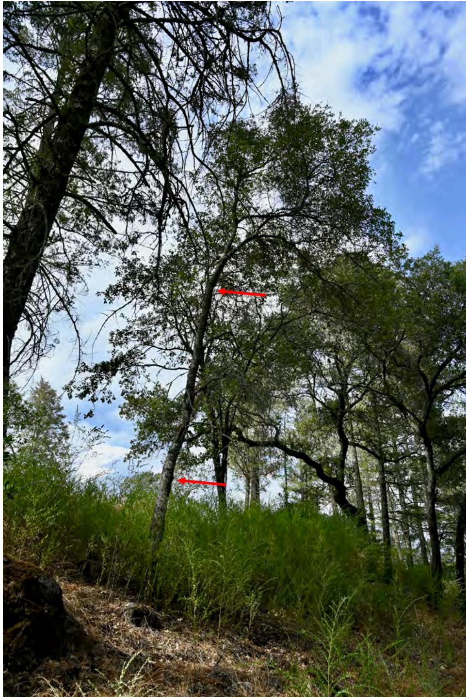
Tree #13, a coast live oak likely located in the road grading limits.