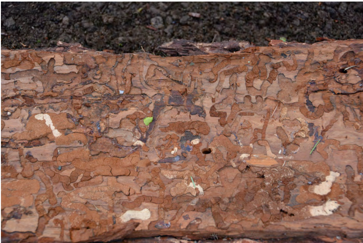
Larval galleries of the flatheaded fir borer (Kenwood, CA)