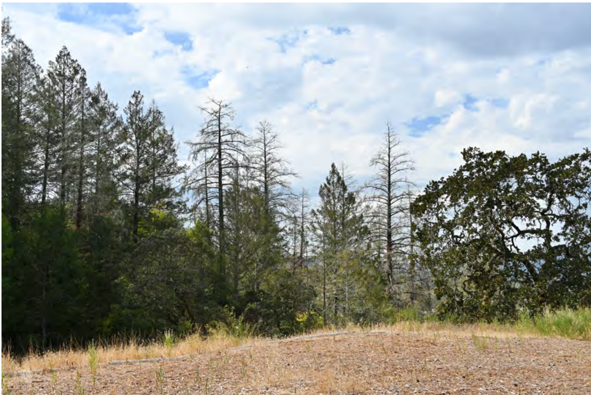
View to the northwest from the central portion of the property. The dead firs tend to be in clusters because of the method of infestation from FFB.