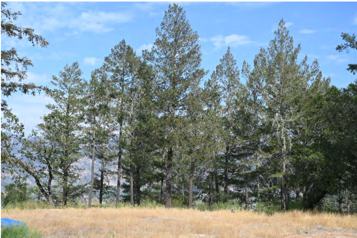
View of trees located in roadway realignment grading limits. Sixteen trees will require removal. The Douglas firs are in marginal health due to drought and boring insect attacks (flatheaded fir borer).