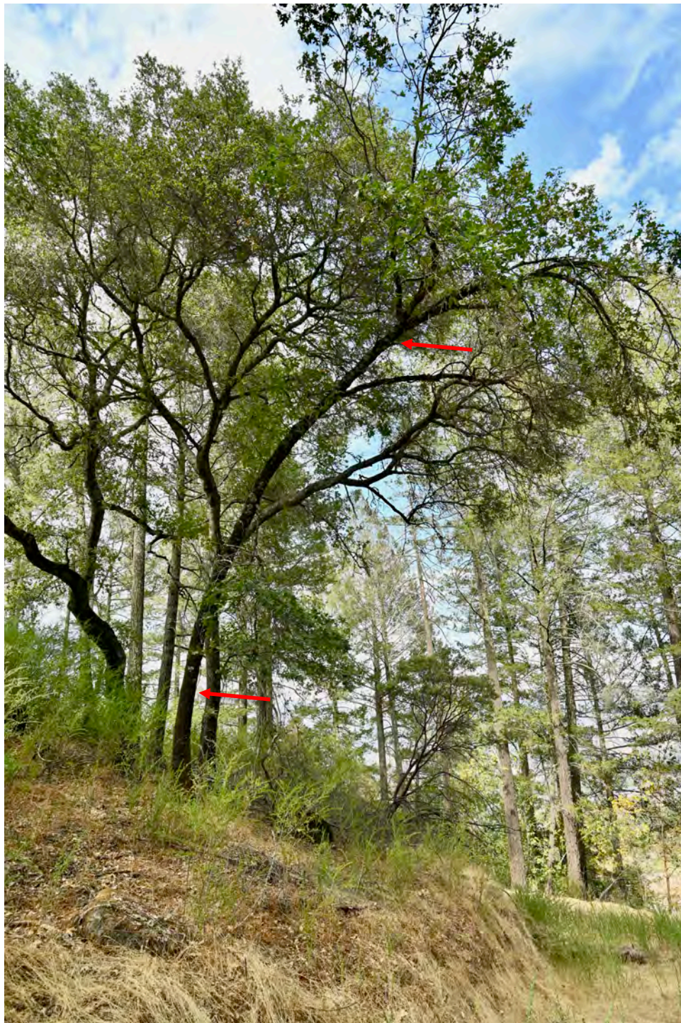
The red arrows indicate the bowed form of tree #12, a black oak. The tree is near the edge of the proposed grading limits and may require removal.