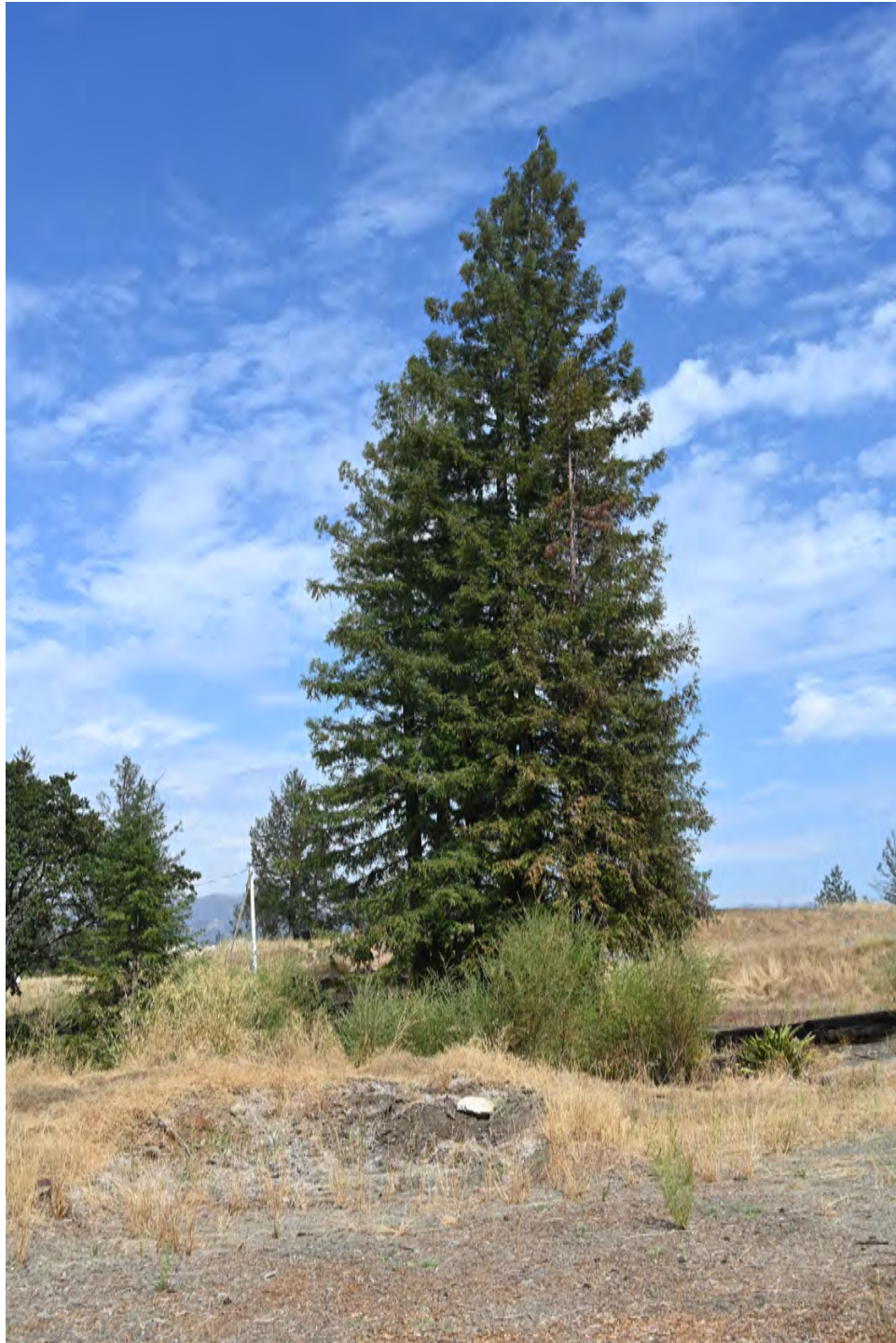
The coast redwoods on the site are also generally in moderate health.