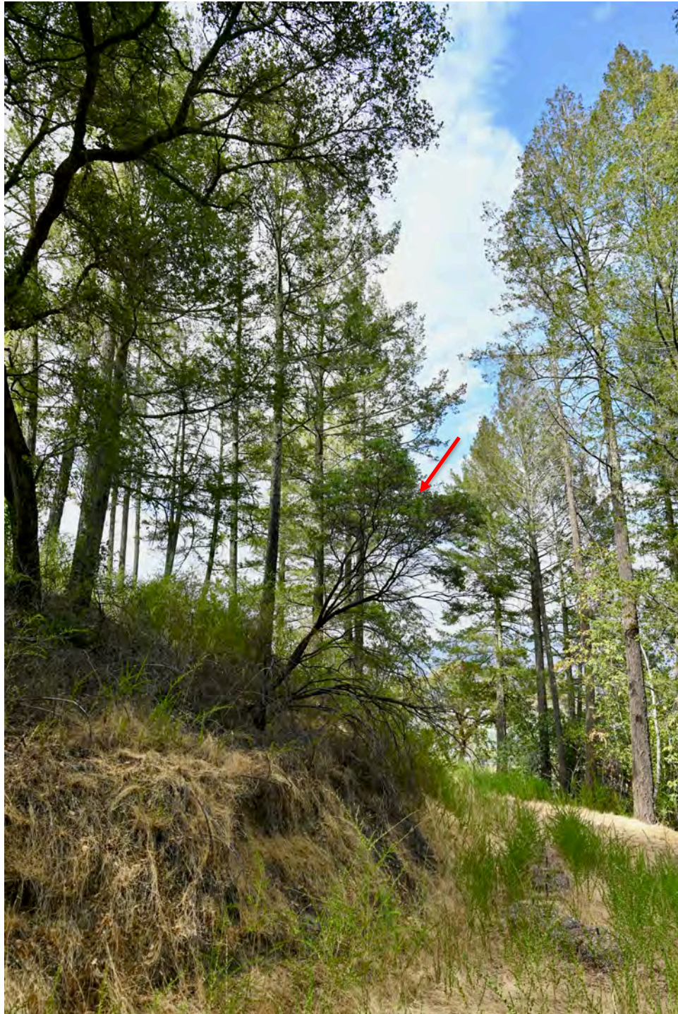
View from the north with the arrow indicating tree #9, a small coast live oak growing on the cut slope and within the grading limits. Also, the thinning crowns of the Douglas fir are evident.