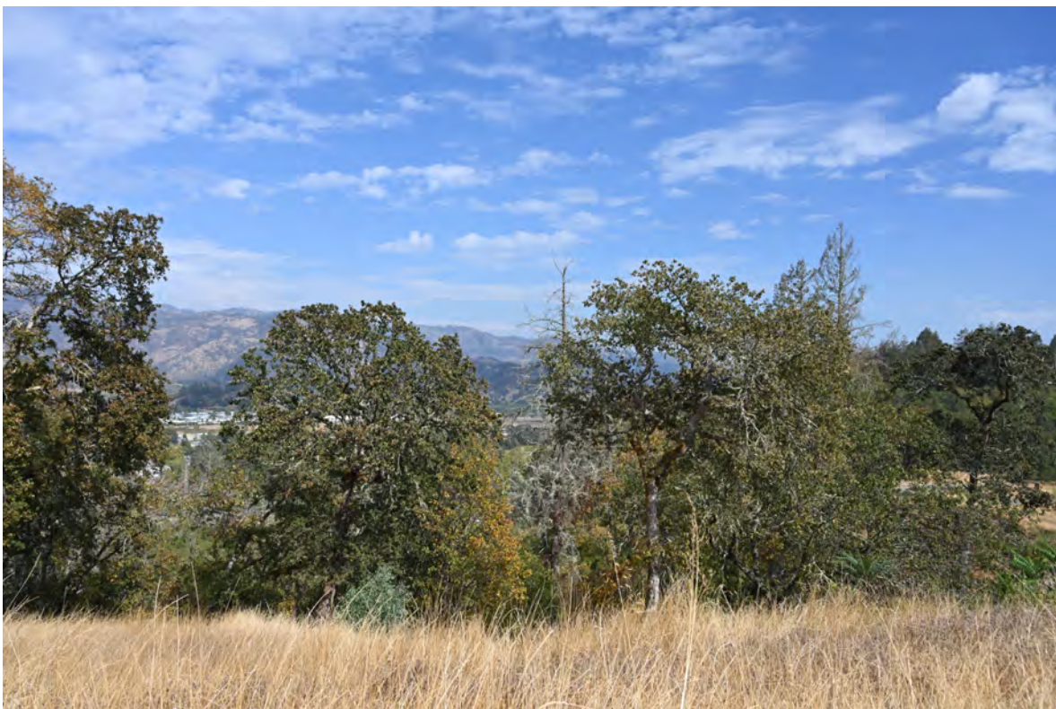
The various native oak species are generally in moderate condition despite the drought conditions.