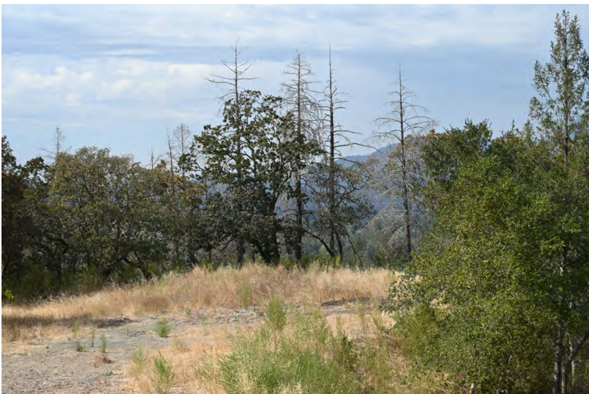
There are numerous dead firs on the north downslope side of the property. Many are on the neighboring property.