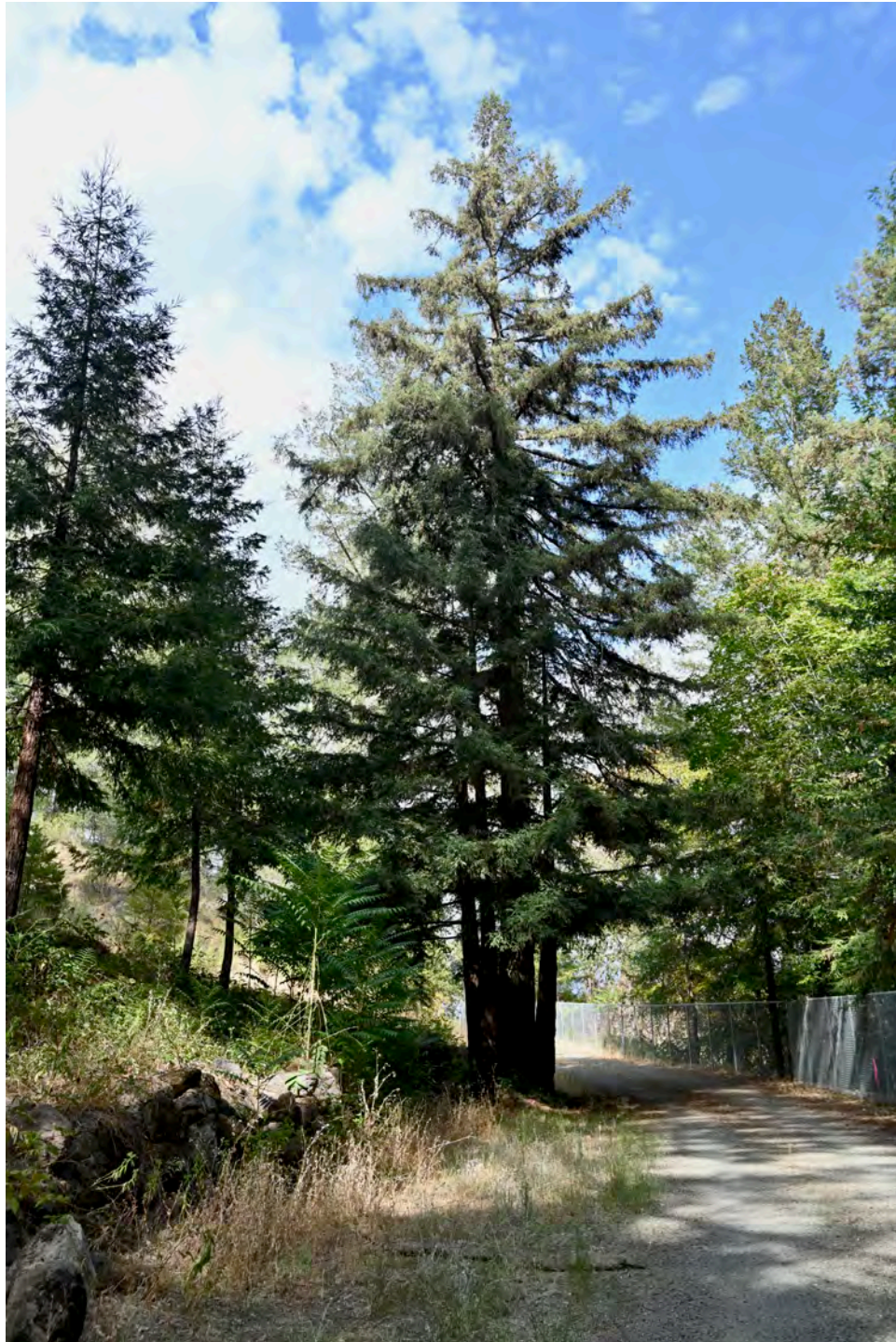
Tree #20, a coast redwood, is located in the road grading limits (GPS waypoint 003). Depending on the required minimum road width for fire equipment, efforts will be made to retain the tree.