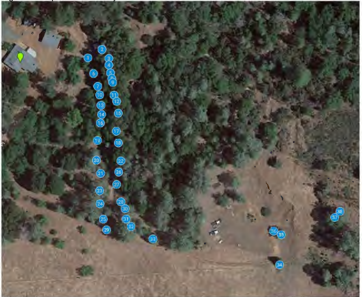
Aerial view of site and tree locations.

Tree removal and earthwork associated with the project requires a Grading Permit from the County of Lake. Chapter 30, Grading Ordinance, of the Lake County Municipal Code references Public Resources Code Section 21083.4 regarding the loss of Oak woodlands. As part of the determination made pursuant to the discretionary approvals (Use Permit, in this case), a county shall determine whether a project within its jurisdiction may result in a conversion of oak woodlands that will have a significant effect on the environment. If a county determines that there may be a significant effect to oak woodlands, the county shall require one or more of the following oak woodlands mitigation alternatives to mitigate the significant effect of the conversion of oak woodlands: