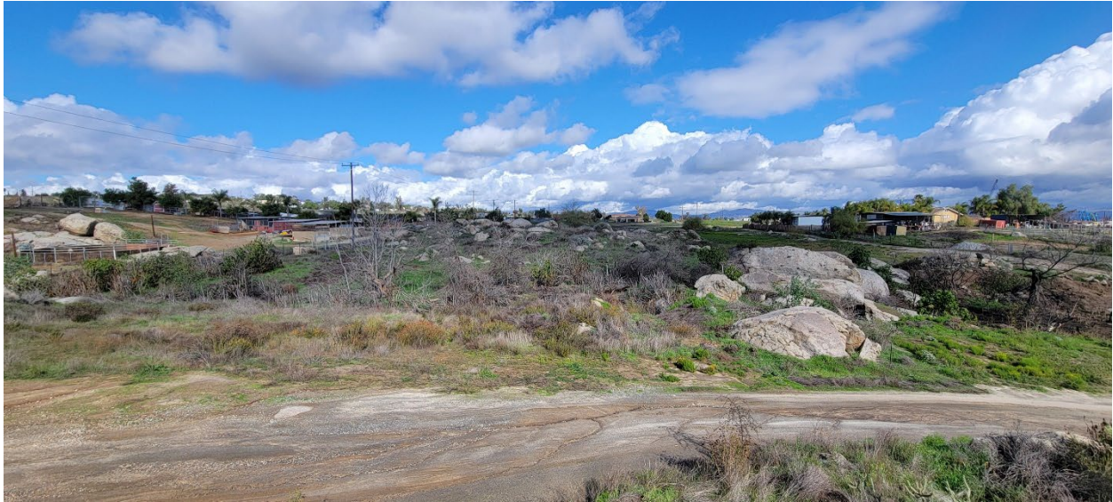
Figure 8-1. Overview of the Project site, facing north.

A total of 35 manually excavated STPs were conducted across the Project area in a grid pattern. Some of the STP locations were offset slightly, as they were initially plotted on top of granite boulder outcrops, but these were moved by no more than 2 m. Appendix B includes a map showing the locations of the STPs. The results of the Phase II testing follow.