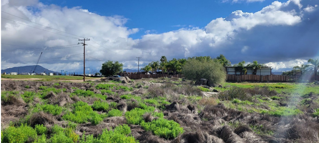
Figure 8-5. Overview of CA-RIV-8683/H, facing east.