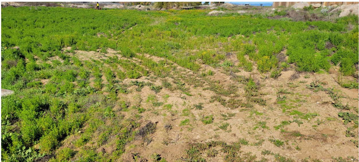
Figure 8-2. Overview of surface disturbance throughout the Project site, facing north.