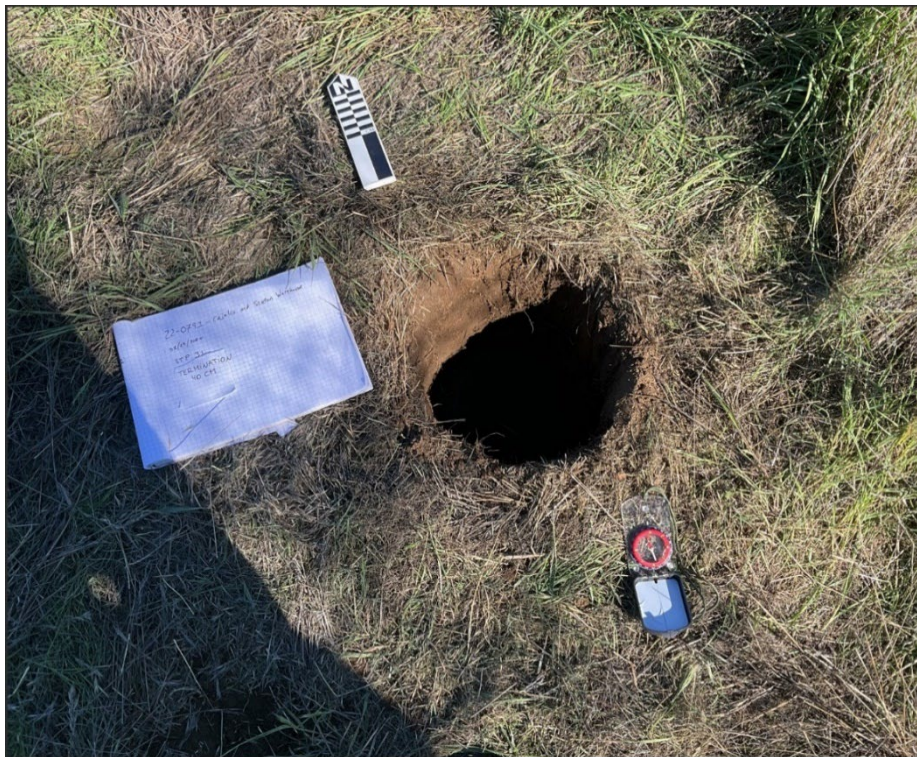
Figure 8-6. Overview of STP 31 at final depth of 40 cm.