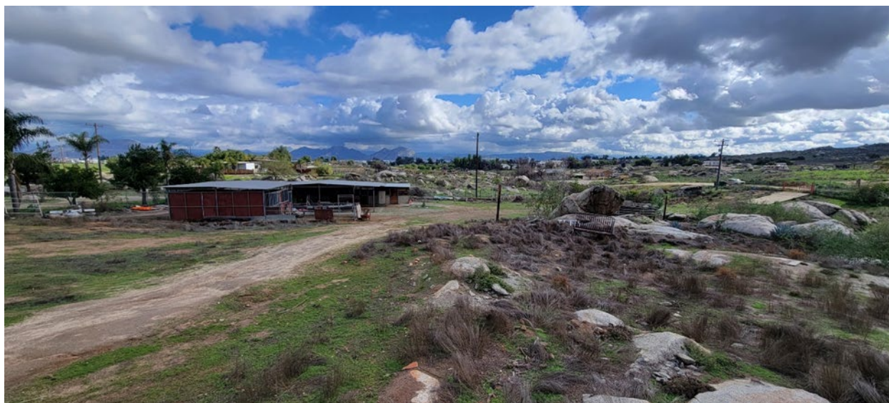
Figure 8-4. Overview of site CA-RIV-8681, facing east.

With the exception of STPs 12 and 27, the topsoil layer of CA-RIV-8681 extended unilaterally to approximately 25 cm deep throughout the site (see Table 8-1). Soils exhibit a consistent Munsell typology of 10YR 3/4 to 10YR 4/4 brown sandy loam with slightly loose, but friable medium/coarse grain in the middle and northern half of the site. STPs in the southern half of the site mostly displayed a Munsell color of 7.5 YR 3/4, and remained similar in consistency with the overall site of friable medium coarse sandy loam, although it becomes a finer grain with increased depth across the site. Topsoil encountered in STP 27 was shallow and transitioned to the decomposing granite bedrock layer, displaying a color of 10YR 4/2 Dark grayish brown in a large, coarse blocky grains through to the termination at approximately 10 cm deep. The topsoil layer remained similar in color and consistency, becoming finer in grain with depth in excavation; a discrete soil change was encountered in only one location, STP 12. The topsoil at this location encountered a slight change in color and consistency at a depth of 10 cm from 7.5 YR 3/4 Dark Brown Coarse grained granular friable loamy sand, to 10YR 3/3 Dark Brown Coarse grained granular friable loamy sand, with a higher concentration of mica below a layer of modern soil erosion mesh.