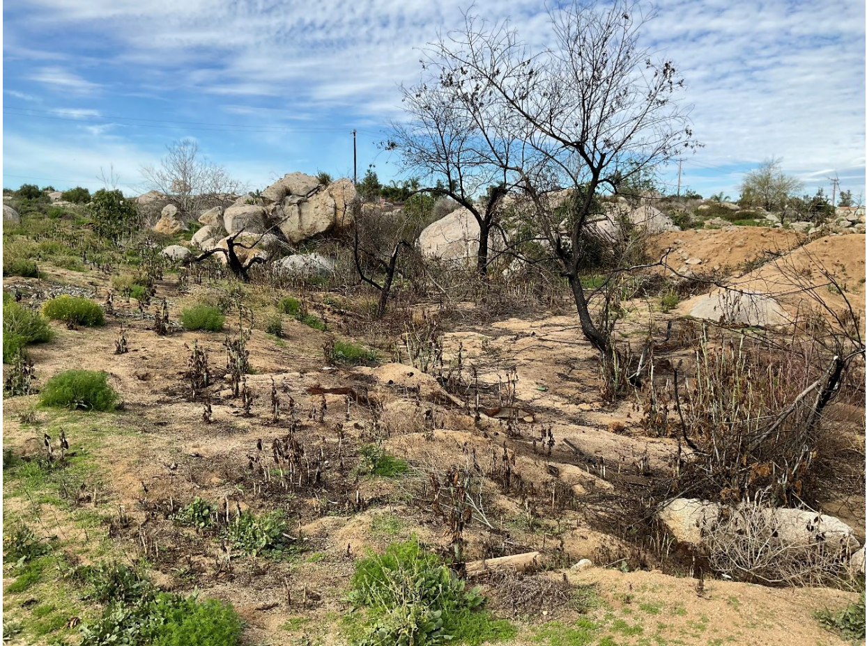
Figure 8-3. Overview of wash with recent burn scars, facing west.