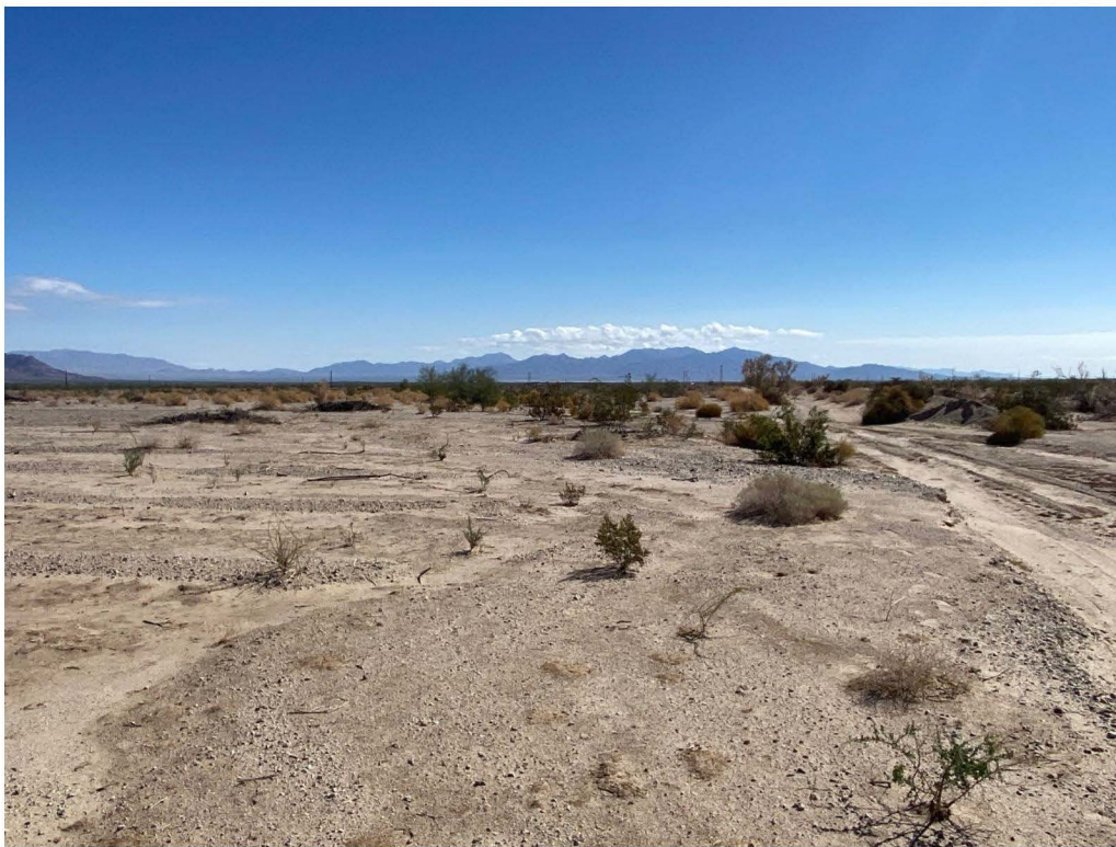
Figure 7-2. View of the Project area showing eroded access road, facing east.