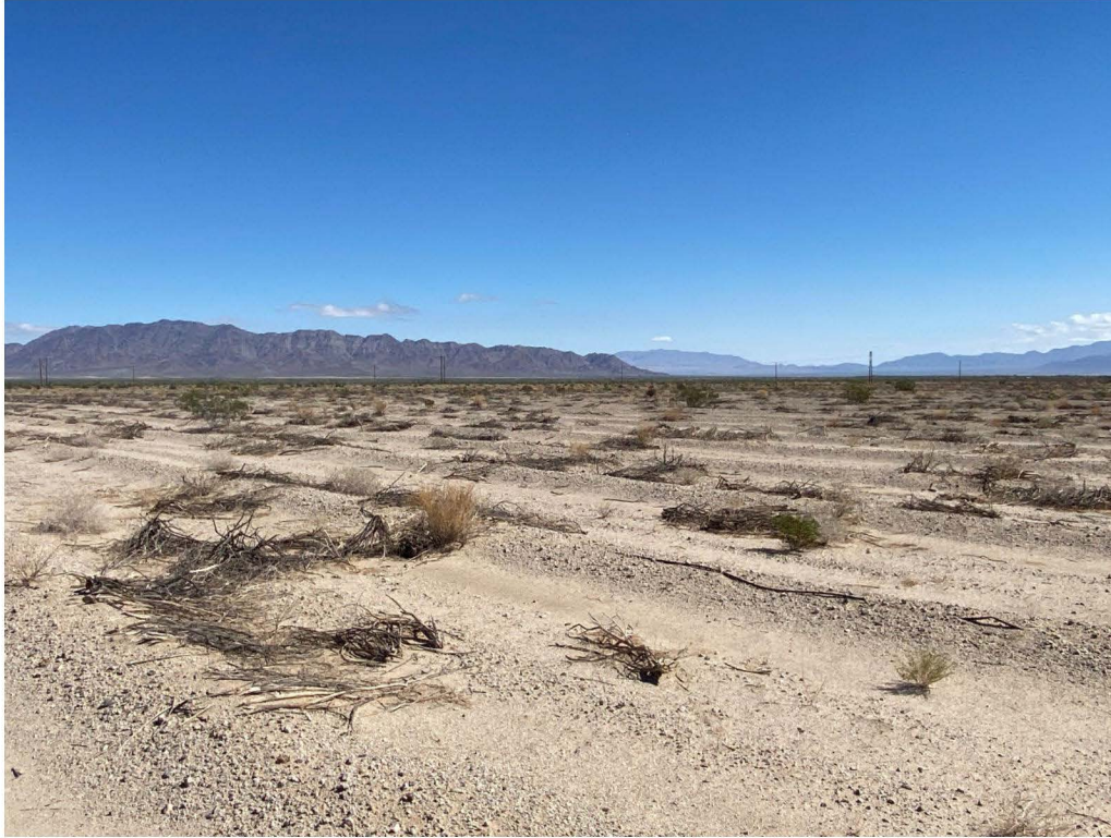
Figure 7-1. View of the fallow jojoba fields within the Project area, facing northeast.