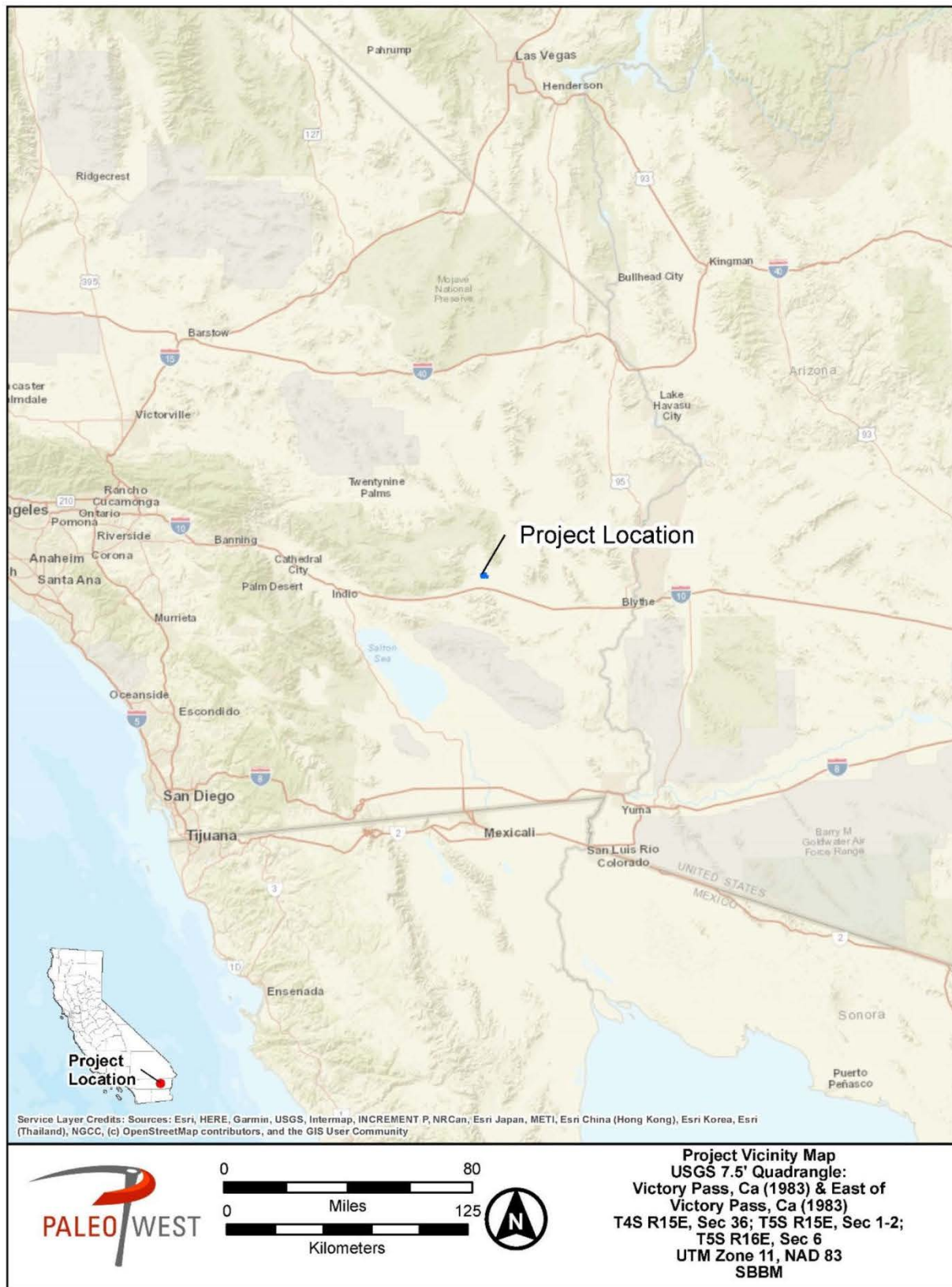
Figure 1-1. Project vicinity map.