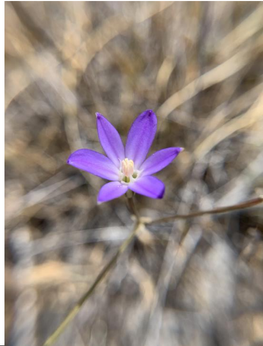
Threadleaf brodiaea ( Brodiaea filifolia )