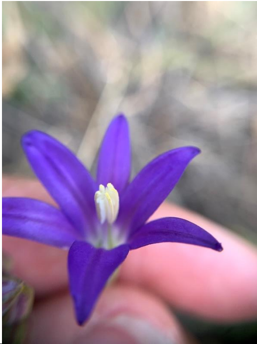
Orcutt's brodiaea ( Brodiaea orcuttii )