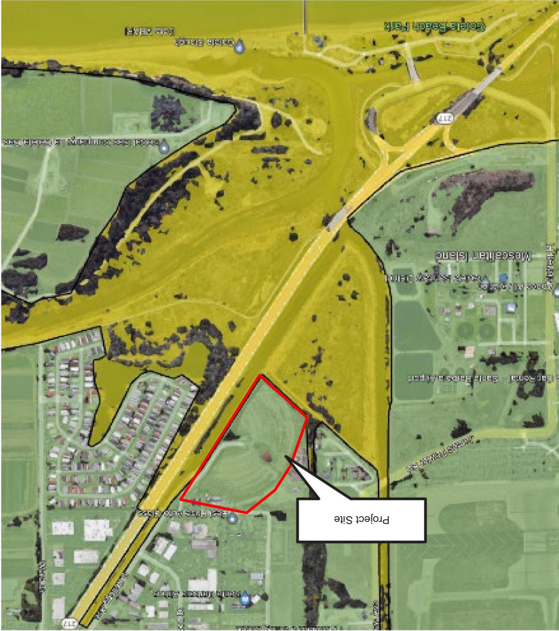
Figure 2 - Tsunami Hazard Area Map (Yellow Shading)