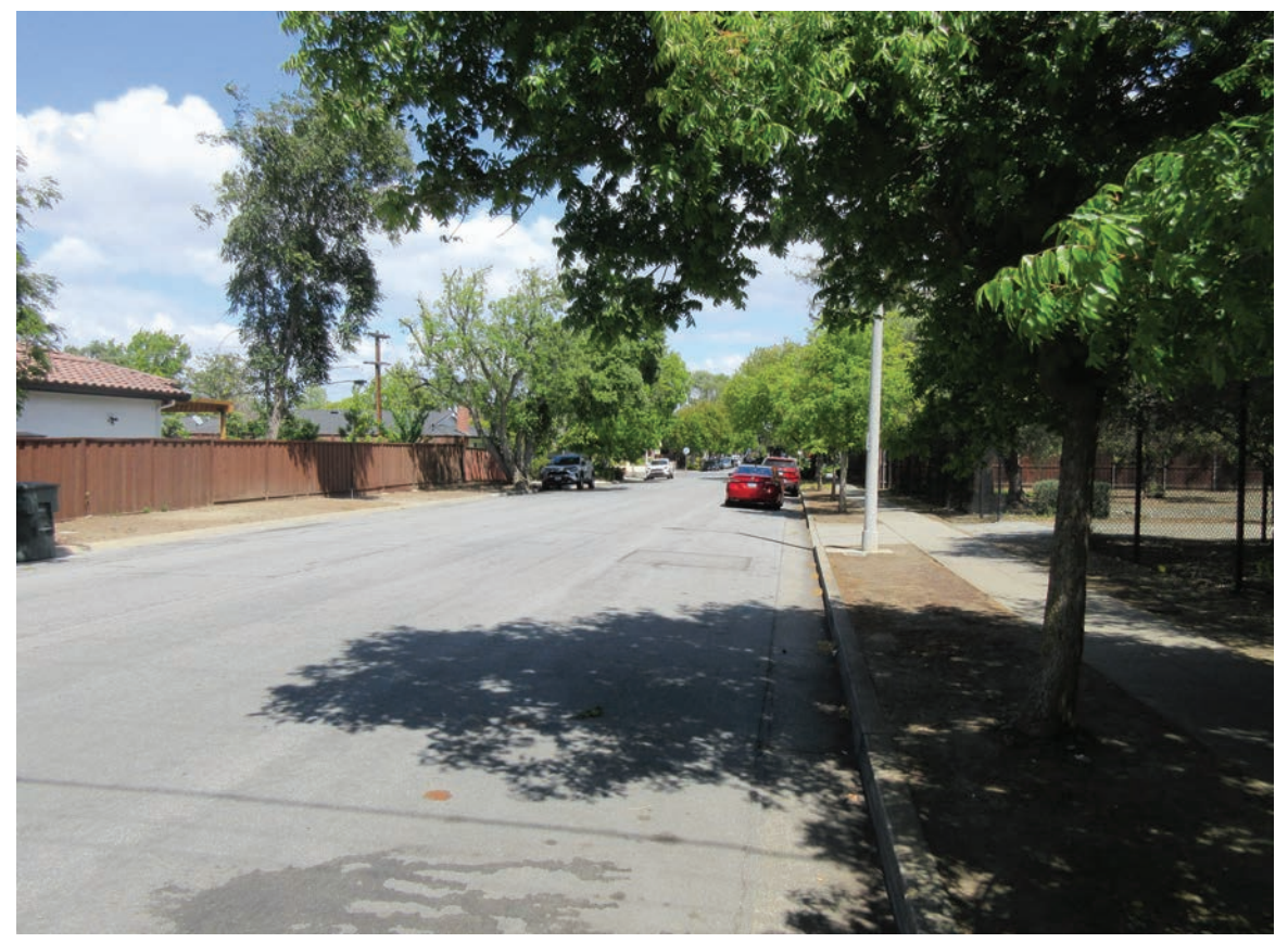
Photo 2: View from the northwest corner of the project site looking east on Carlisle Way.