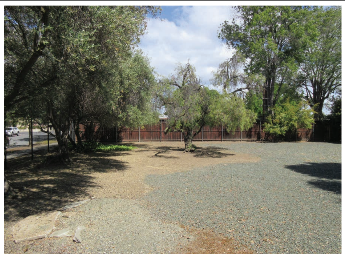
Photo 5: View from the project site looking east towards the adjacent residential uses.