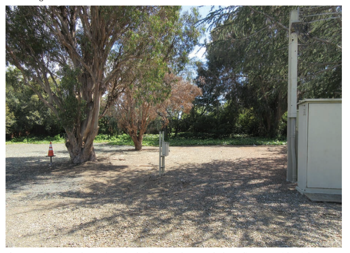
Photo 4: View from the project site looking south towards the adjacent residential uses.