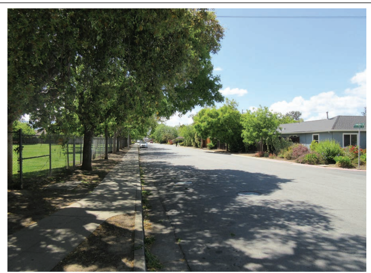
Photo 1: View from the northwest corner of the project site looking west on Carlisle Way.