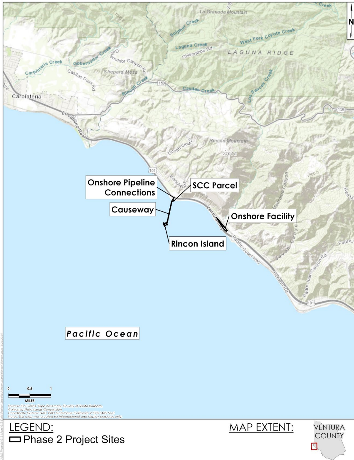
Figure ES-1. Site Location Map

of the facility's oil and gas well plugging and abandonment process (Phase 1). Figure ES-2 provides an overview of the proposed Project sites.