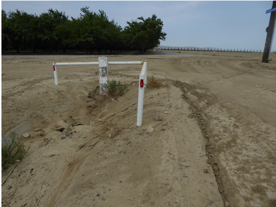
Photograph #3 (above). Irrigation ditches line the agricultural field and ruderal areas of the project site. Photograph #4 (below). Two solitary mulberry trees were identified along the sites southern boundary.