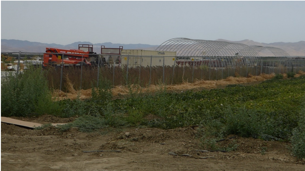
Photographs #5 (above) and #6 (below). Within agriculture and ruderal land uses, ag equipment storage and beekeeping were evident within the project site.