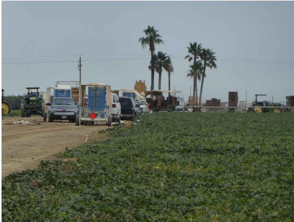
Photograph #1 (above). Cantoupes were actively being harvested on the western three quarters of the site during the July 2021 field visit. Photograph #2 (below). The eastern third of the site was mostly barren with a single borrow pit located in the center of the ruderal area.