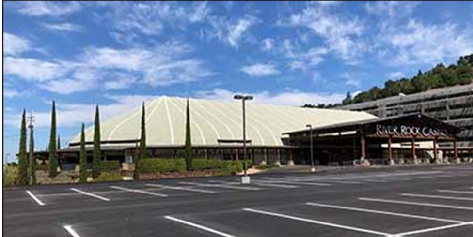
River Rock Casino