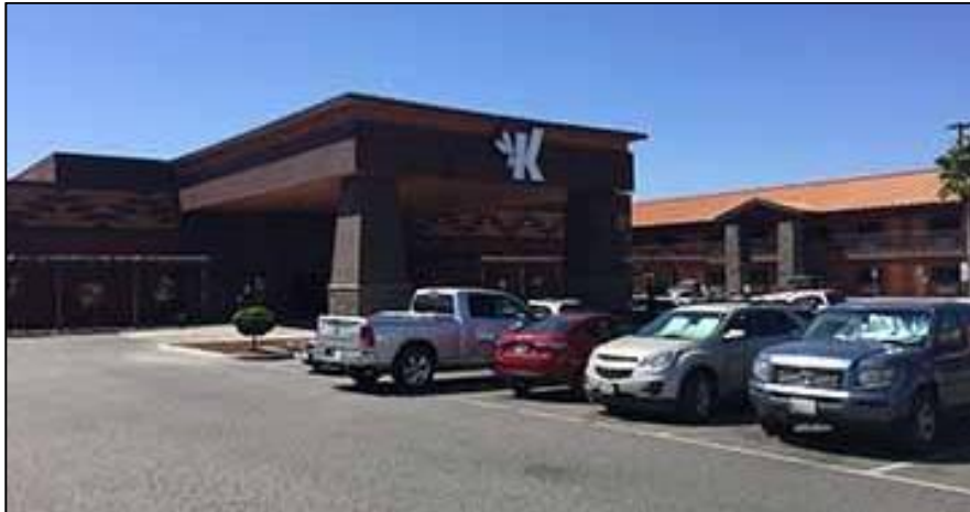
Konocti Vista Casino Resort