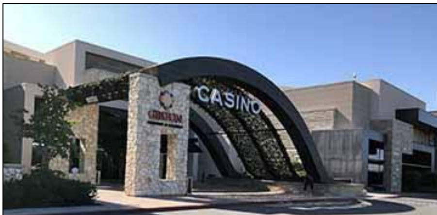
Graton Resort & Casino

In April 2022, Graton announced that it is moving forward with an expansion including roughly 144,000 square feet of new gaming space, a new 221-room hotel tower, a 3,500-seat theater, additional F&B, parking, and other property improvements.