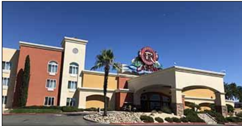
Robinson Rancheria Resort & Casino