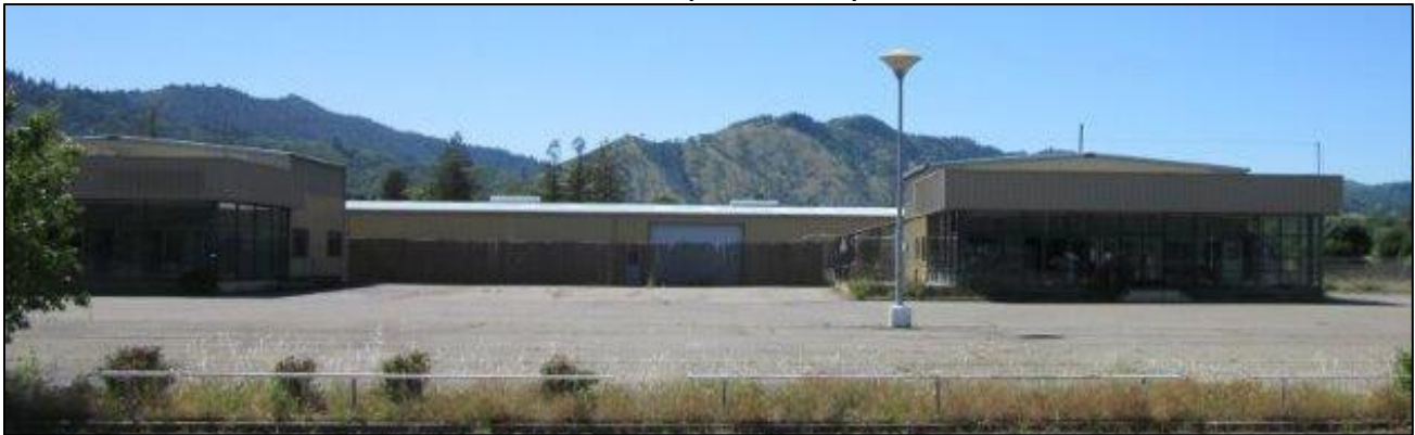
Pinoleville Casino Proposed Development Site

JW Gaming, the tribe's original partner, had initially invested $5.8 million. In March of 2018, JW Gaming filed a lawsuit against the Pinoleville Pomo Nation and the Canneles Group, alleging fraud and breach of contract. An attempt by the tribe and the Canneles Group to have the lawsuit dismissed was denied by the U.S. District Court in October of 2018. Undeterred, the tribe obtained a new development partner. For the purposes of this analysis, given uncertainties surrounding the project's future, GMA did not assume the project would come to fruition during the analyzed forecast period.