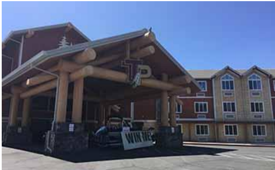
Twin Pine Casino & Hotel