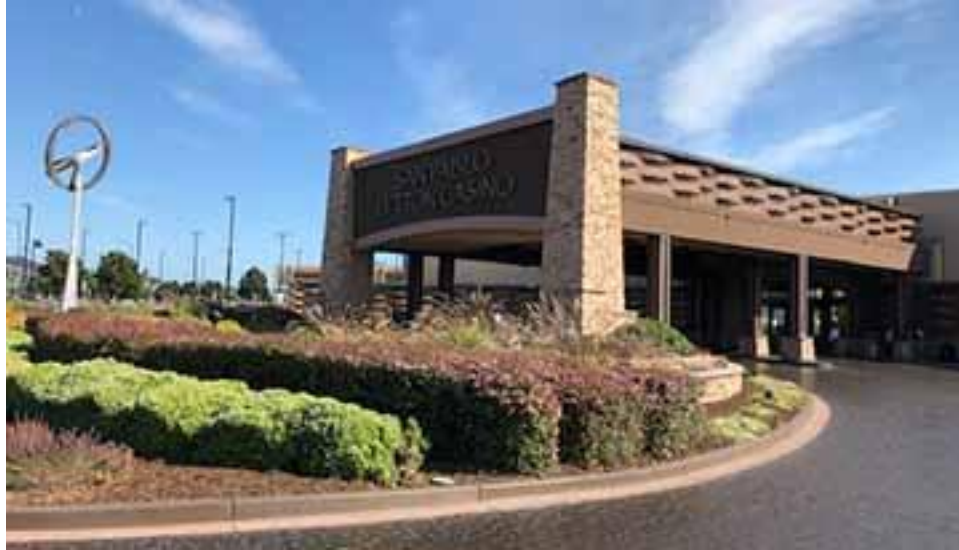
San Pablo Lytton Casino