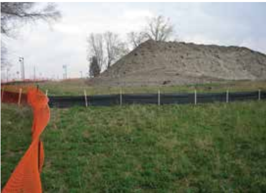
Stockpiled Excavation Material

On-site enforcement: The inspector should verify that the list of universal waste materials shown on the construction documents is being disposed of properly. The inspector may ask for haul tags and/or reports from the contractor to verify compliance with the code. Verification by documentation from a waste management company or recycling facility is acceptable.