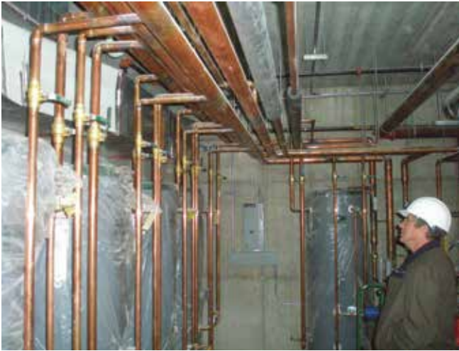
Verification of Systems

the building components tested, the testing methods utilized, and include any readings and adjustments made.