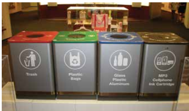
Recycling by Occupants

Note: A sample ordinance for use by local agencies may be found in Appendix A of the document at the CalRecycle’s web site.