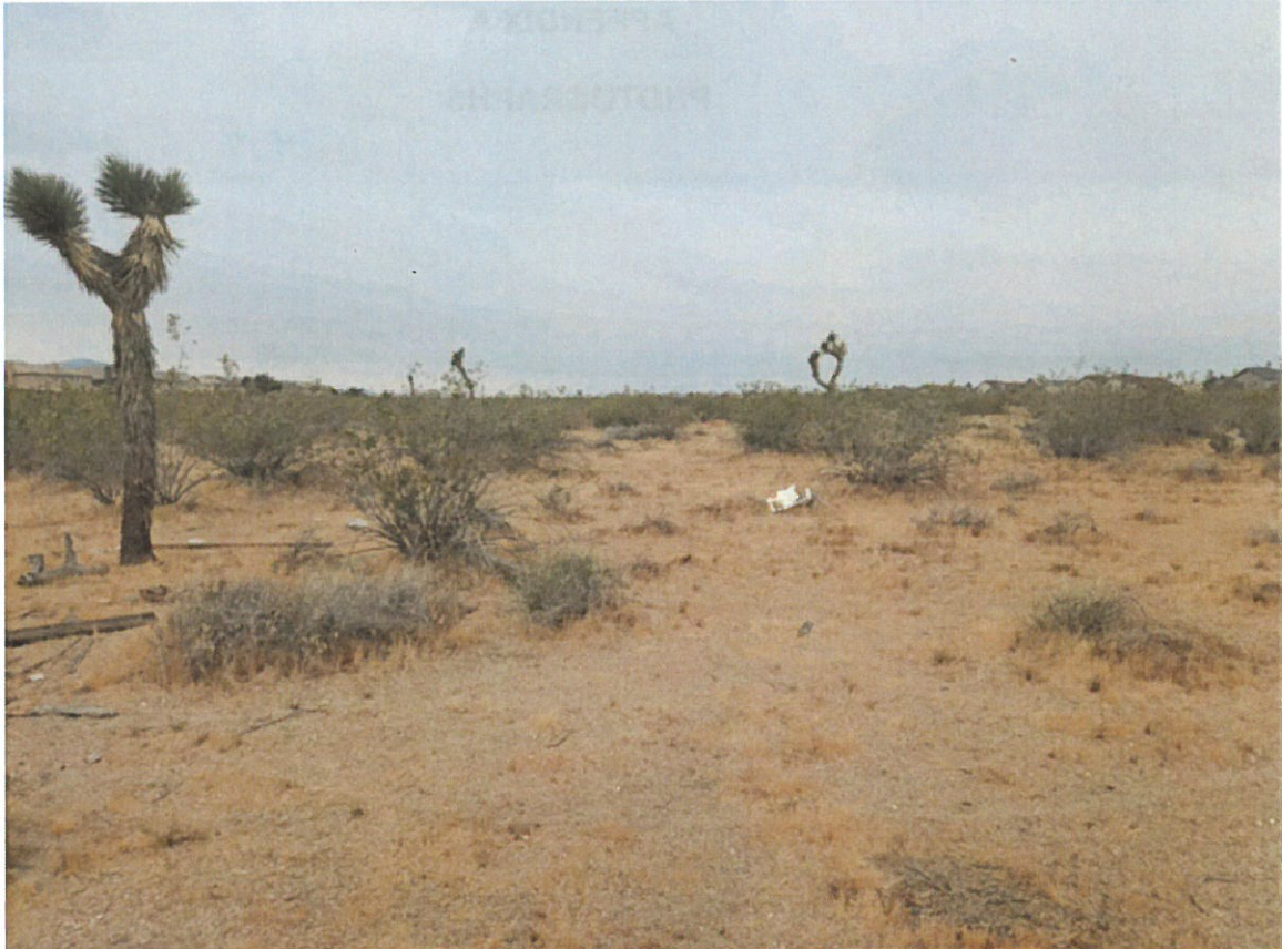
1. Project Site Overview (Southwest View)